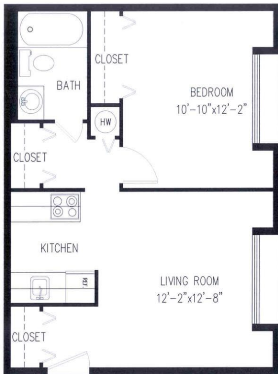
TYPICAL LARGE APARTMENT PRESBYTERIAN HOMES OF BRADENTON

This community of 210 apartments is a three story, low-rise design situated on three acres of well-maintained grounds, offering a spacious and home-like atmosphere. There are elevators conveniently located to service the upstairs residents. Each of the buildings is connected by covered walkways. Shopping centers, banks, doctors, restaurants, places of worship, and community services are located conveniently nearby.